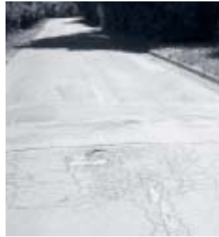
AN EXAMPLE OF A FAILED STREET (MAR WEST).

The Hawthorne-Pilgrim Heights Undergrounding area, consisting of approximately 89 properties, is the next potential utility undergrounding district. The property owners and the Town Council will be deciding whether or not to move forward with formation of this district later in 2007.